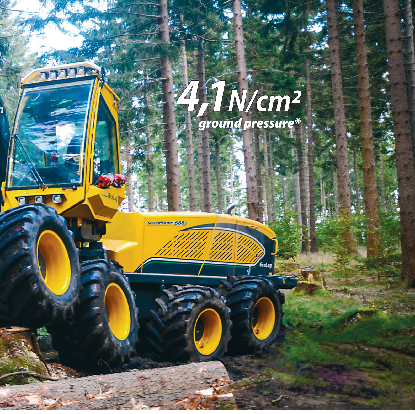
^* Depending on installed equipment.